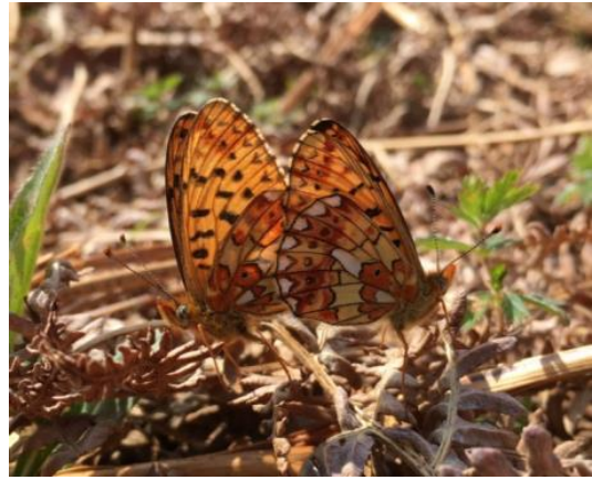
Figure 2: Pearl-bordered fritillary

Small Pearl-bordered fritillary are also on the wing. They live in a similar habitat to Pearl-bordered but can cope with slightly wetter conditions so are also found in the valley bottoms in damp grassland where they feed on Marsh violet.