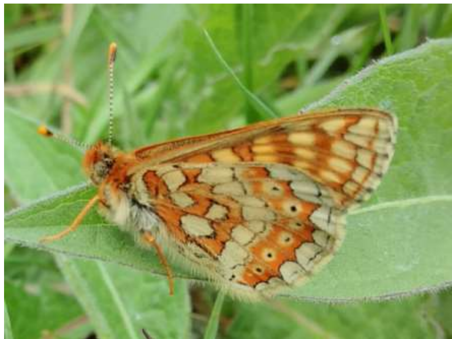
Early 2017 adult MF emergence photo, north of Ynys Dawela in Brynamman on 19 th