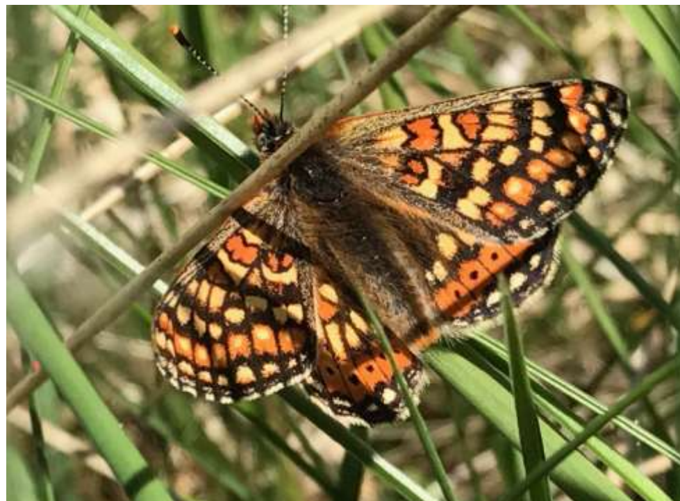
Early 2017 adult MF emergence photo, Mynydd y Bach Cocs on Gower Commons on 20th.