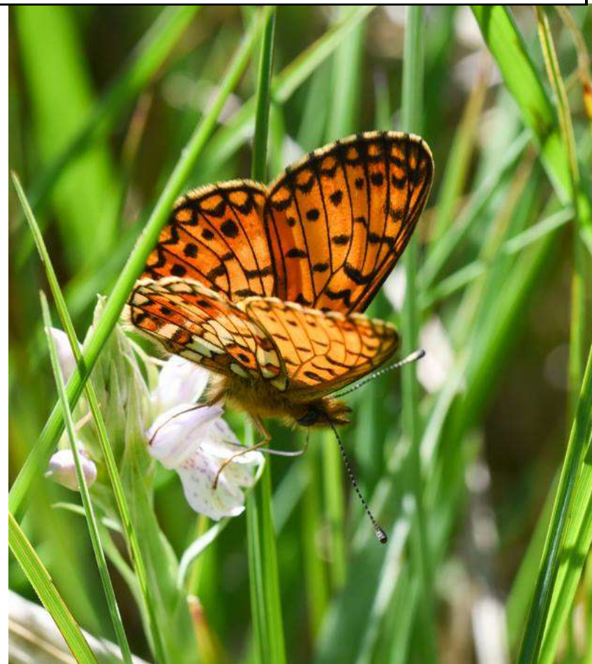
Photo: Small Pearl-bordered Fritillary at Llantrisant Common.

There are already reports of MF adults from 23 locations in South Wales.