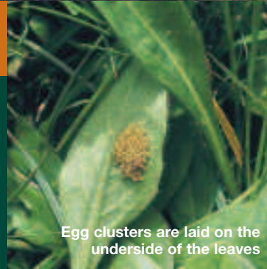
Egg clusters are laid on the underside of the leaves

The Marsh Fritillary breeds on damp, flower-rich grasslands in the west of England. These grasslands contain a mixture of rushes, marshy grasses and wet heathland. Good breeding areas are usually a patchwork mix of short and long tussocky grass with plentiful Scabious plants. Some grass or leaf litter is important for the caterpillars to bask on.