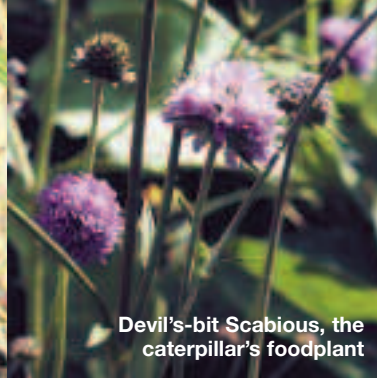
Devil's-bit Scabious, the caterpillar's foodplant