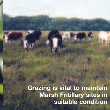
Grazing is vital to maintain Marsh Fritillary sites in suitable condition