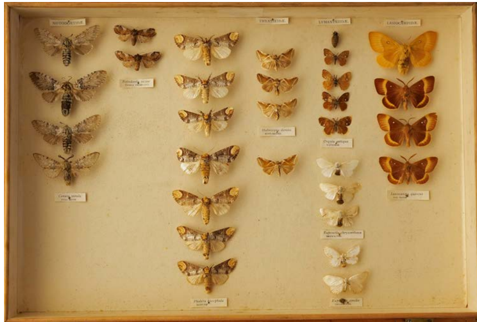
MOTHS: Puss Moth etc