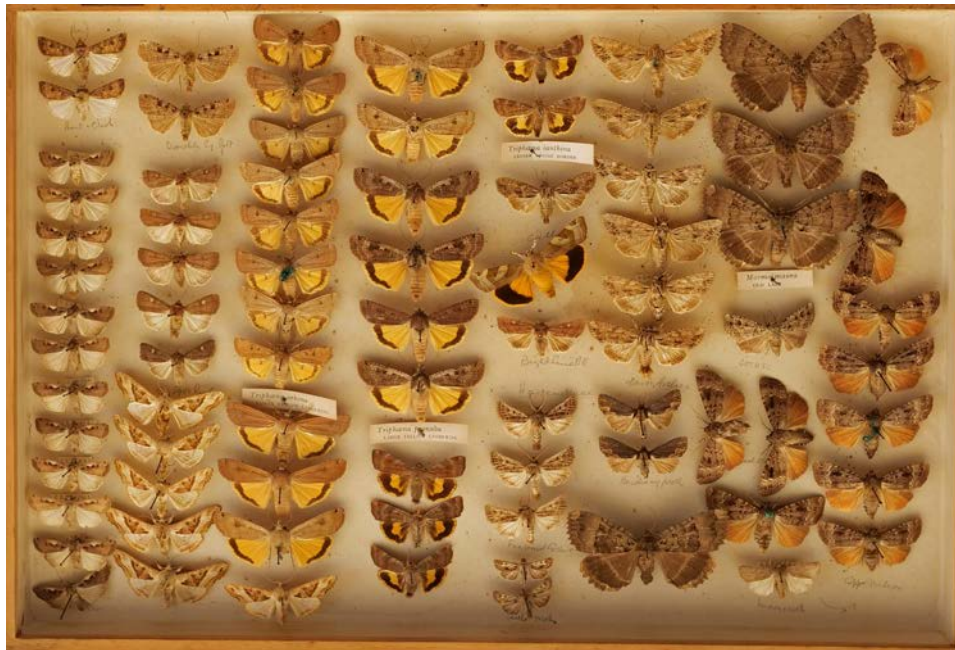
MOTHS: Heart and Club