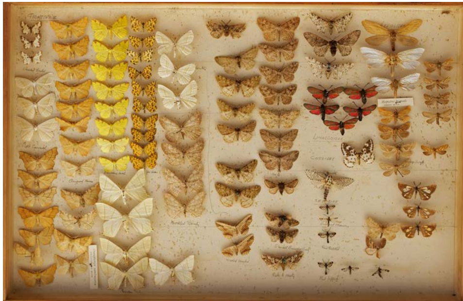
Clouded Border etc