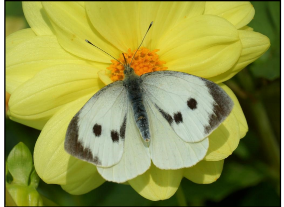
Large white butterfly

Has paler wing markings than Large white.