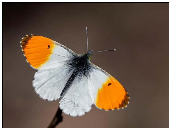
Orange tip butterfly