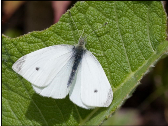
Small white butterfly

Use this spotter sheet to help you identify and spot our most popular butterflies to your garden between April and June. Tick them if you see them.