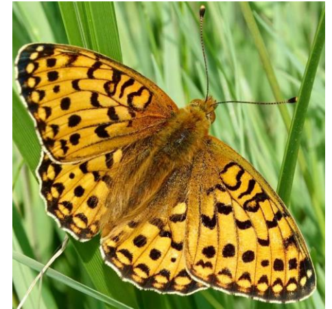
Dark Green Fritillary: Ian Gorton.

Ian Gorton posted: "Dark Green Fritillary at Gronant Dune 13/6/2020 ".