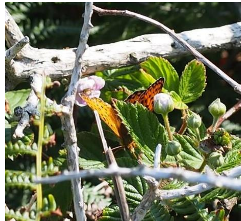
Dark green Fritillaries

I went home after my walk and went to check one of the fields I graze, I saw, for the first time , a Dark Green Fritillary - then a Small Pearl Bordered Fritillary, both firsts for this field although I have seen single SPBFs on the common next door.