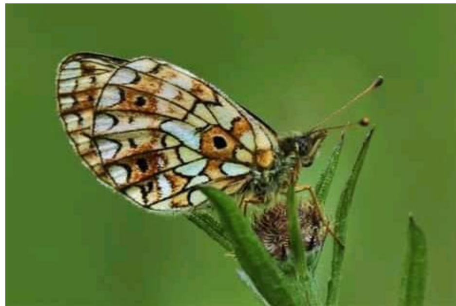
Small Pearl-bordered Fritillary

Simon Bazeley posted his photo (right) of Small pearl bordered fritillary at Aberbeeg on 6. 7. 21