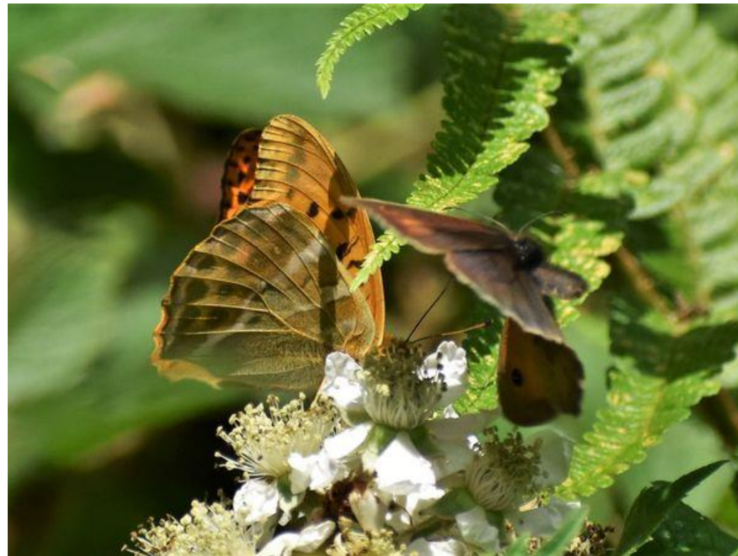
Silver-washed Fritillary