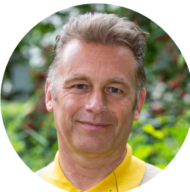
CHRIS PACKHAM CBE, VICE PRESIDENT OF BUTTERFLY CONSERVATION, WILL CLOSE THE MEMBERS' DAY SESSION WITH A TALK ABOUT WHY SPECIES MATTER AND WHY WE NEED TO TAKE ACTION NOW