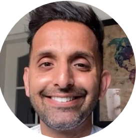
DR AMIR KHAN, AMBASSADOR OF BUTTERFLY CONSERVATION, DISCUSSES THE HEALTH BENEFITS OF CONNECTING WITH NATURE, INCLUDING YOUR WELLBEING AND MENTAL HEALTH

Don't miss the opportunity to listen to some fabulous talks from our wonderful supporters!