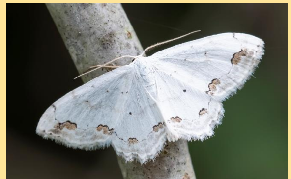
On the South Downs two colonies of the rare Lace Border moth have been found – a new species for Sussex and for the South Downs National Park

Have a Merry Festive Time and here's to an Exciting 2022 Season!