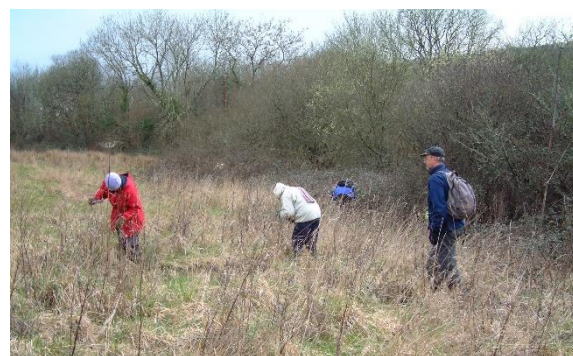
Volunteers searching for Brown Hairstreak eggs on Blackthorn shoots