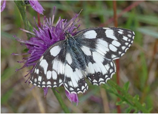
Marbled White (male)