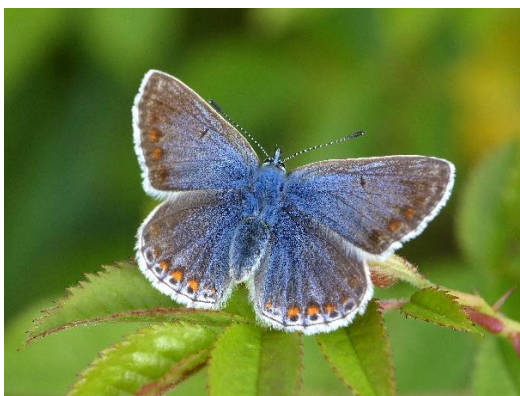
Common Blue – female