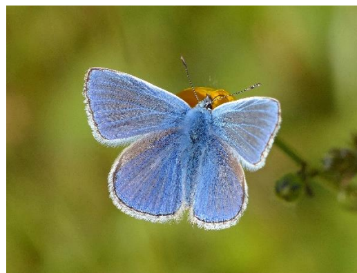
Common Blue – male