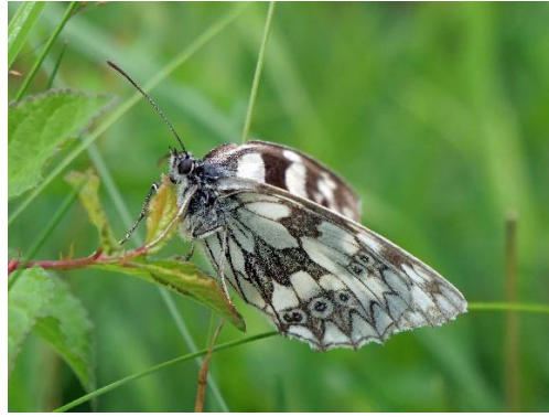
Marbled White (female)