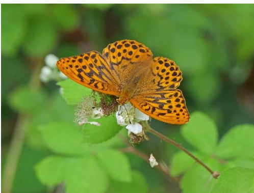
Silver washed Fritillary