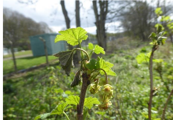
A wilted shoot caused by the moth's larva (David Hill)

The moth's larvae are known to feed on bushes of Red Currant, Black Currant ( Ribes spp) and Wild Gooseberry ( Ribes uva-crispa ). At the Scottish site both Red Currant and Black Currant bushes are favoured. Many of the known British sites are beside rivers under a woodland canopy and this is also true of the Scottish site.