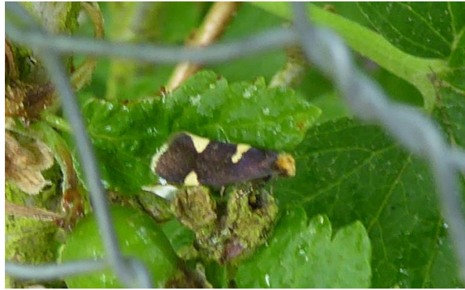
Currant Shoot Borer ( Lampronia capitella) in Lanark