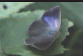
Purple Hairstreak (left) breeds on oak and White-letter Hairstreak (right) breeds on elm. They feed on aphid honeydew in the canopy and less often (Purple Hairstreak rarely) descend to nectar at flowers. Green Hairstreak (not shown) breeds on various shrubs