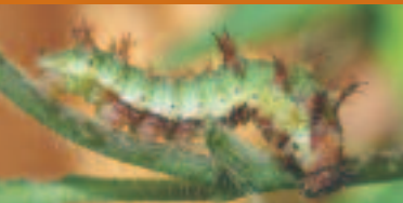
White Admiral breeds on honeysuckle in more shaded areas (resident)

Many of our commoner butterflies will be encouraged into woodlands that have warm and sunny flower-rich tracks and glades. Other species (not shown) may also be seen in woods from time to time, such as Essex, Grizzled and Dingy Skippers, Brown Argus, Common Blue, Painted Lady, Marbled White and Small Heath.