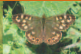
Speckled Wood (left) and Ringlet (right), along with Meadow Brown and Gatekeeper, breed on various grasses beside rides, and visit flowers for nectar