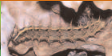
Silver-washed Fritillary breeds on violets in dappled shade (potential colonist)