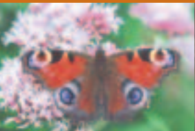
Small Tortoiseshell (left) and Peacock (right) breed on ride-side nettles and like Comma and Red Admiral they all visit flowers