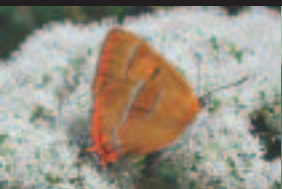
Comma (left) can be common along rides. The rare and elusive Brown Hairstreak (right) lays its eggs on low, young shoots of blackthorn in wooded districts. Never very common, it may be able to recolonise