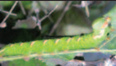
Caterpillars of the Great Prominent (left) are leaf-green and feed on oak leaves. The male Oak Eggar (right) is a scarce, large, orange-brown moth which may be seen in fast flight on sunny July days in wooded areas, and can be mistaken for a fritillary.