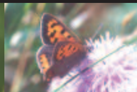
Small Copper (left) and Holly Blue (right) can colonise rides and glades.