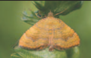
Several species can often be disturbed from foliage or low growing plants as you walk through a wood, for instance the orange coloured Yellow Shell (left) and the black and white Silver-ground Carpet (right).