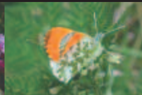
Orange Tip (left) and other whites can breed along rides. Brimstone (right) breeds on buckthorn bushes