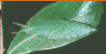
Purple Emperor breeds on sallows and adults feed on aphid honeydew and tree sap (resident)