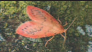
The larvae of Rosy Footman (left) feed on lichens on tree trunks. The Speckled Yellow (right) visits flowers during the day in May and June. In Hertfordshire it seems to be restricted to woods in the south, its larvae feeding on wood sage.