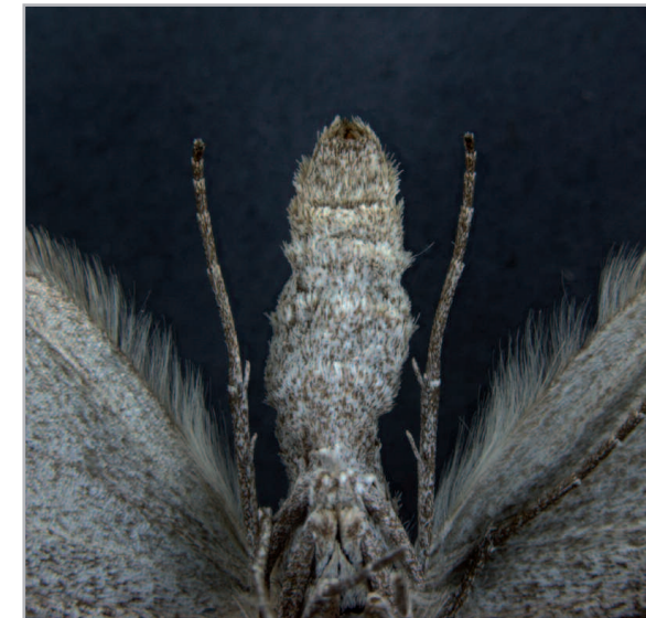
34. Aplocera efformata