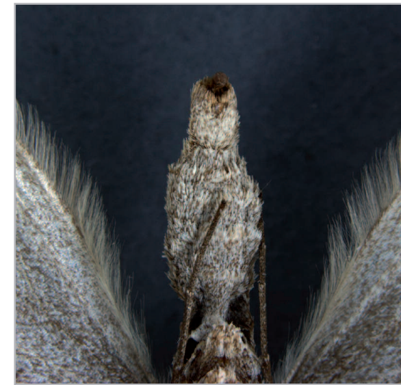
32. Aplocera plagiata

Ductus bursae (C) very bowed, with sharp bend after straight section from ostium..... efformata